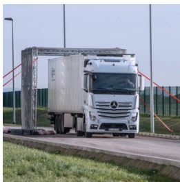
Image 3: The RFID technology provides a precisely timed overview of goods movements and reliably pinpoints their location.

Image 2: The RFID tags incorporated in the pallet foot are loaded with specific data immediately after production.