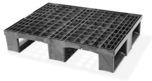
Image 1: The Heilbronner half-pallet from Cabka-IPS with RFID technology is designed to be the future standard bearer for production facilities with a high level of automation.