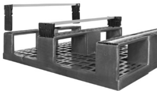
Image 2: Thanks to three aluminum profiles under the skids, the pallet is well suited for roller and chain conveyors and very resistant to wear.

Image 1: The Heilbronner half pallet by Cabka-IPS is made of plastic and ergonomically designed.